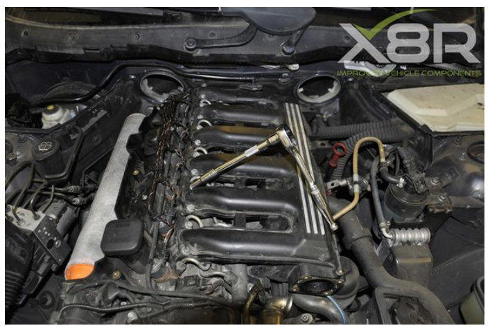
Step 7: Cover inlets - Cover the air inlets with a towel or similar