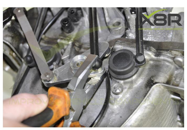
Step 6: Actuator arm repair

We also include in our repair kit a replacement actuator arm. This is rarely required as the lever is normally the fault, however on occasions this can snap or the ball joint receiver can wear causing issues. In this instance cut the arm off 25mm from the actuator end of the arm. Fit the new arm over the top and screw tight to fasten.