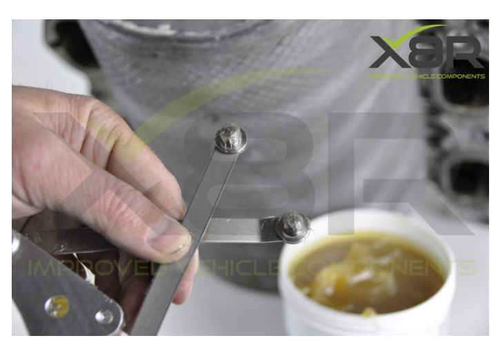
Step 4: Mount the new lever Mound the new lever and refasten the bolt. Apply thread lock compound to the bolt thread and torque up to 9nm / 80in lbs.