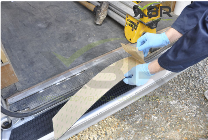
el Vivaro Nissan Primastar Rear Back Bumper Protector Cover Trim Protection Anti Non-Slip Scratch Tread Strip Guard Install